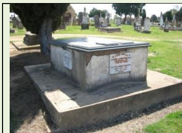
Trewren family crypt at Bathurst

The name in the various spellings of Trewren, Truran, Truren and Treuran is well recorded in the . Truro - Cambourne (Cornwall, England) area from at least the reign of the first Elizabeth.