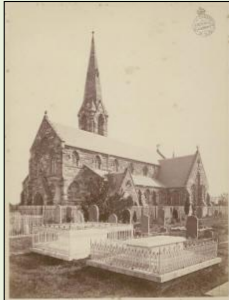
St Stephens, Newtown

(source: NSW Baptism Reg.V18291343 128/1829)